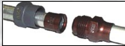
Internal swage sleeve and union

Internally Swaged Hydraulic Fittings – Harrison's internally swaged fittings are mechanically fastened on the end of removable (non-permanent) tube assemblies. These tube assemblies are used in hydraulic and high-pressure pneumatic applications. Internal Swage fittings are attached to the end of tubes by either elastomeric or roller swaging and include sleeves, unions, nuts, and bulkheads. They come in 2-groove and 3-groove versions and can be manufactured from CRES, titanium, aluminum and other exotic metals.